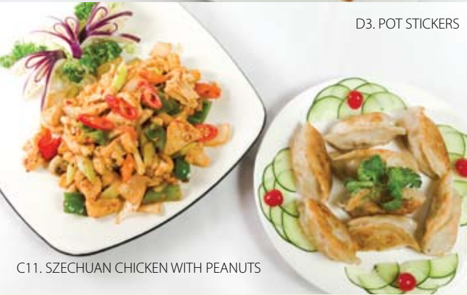
C11. SZECHUAN CHICKEN WITH PEANUTS